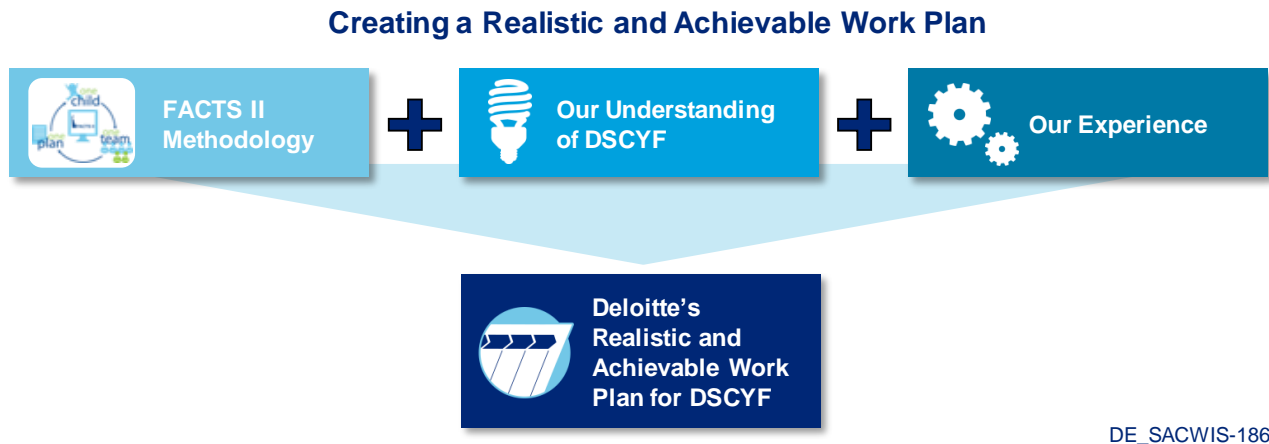
Figure 8-2. Deloitte's Realistic and Achievable Work Plan.

Deloitte's CAFÉ Methodology, understanding of DCFS, and our experience results in a realistic and achievable work plan for DCFS.