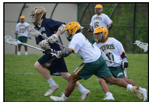
Ferris vs. Salesianum 4/26/17

to learn more about the sport from some of the best athletes and coaches from across the nation. More about the Sankofa Series is located here: http://www.uslacrosse.org/diversity-inclusion/sankofa-clinic-series . Ferris will be one of the first secure care juvenile facilities in the nation to host US Lacrosse!