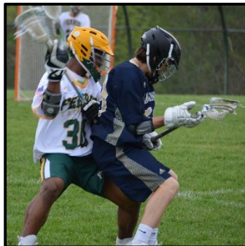
Ferris vs. Salesianum 4/26/17